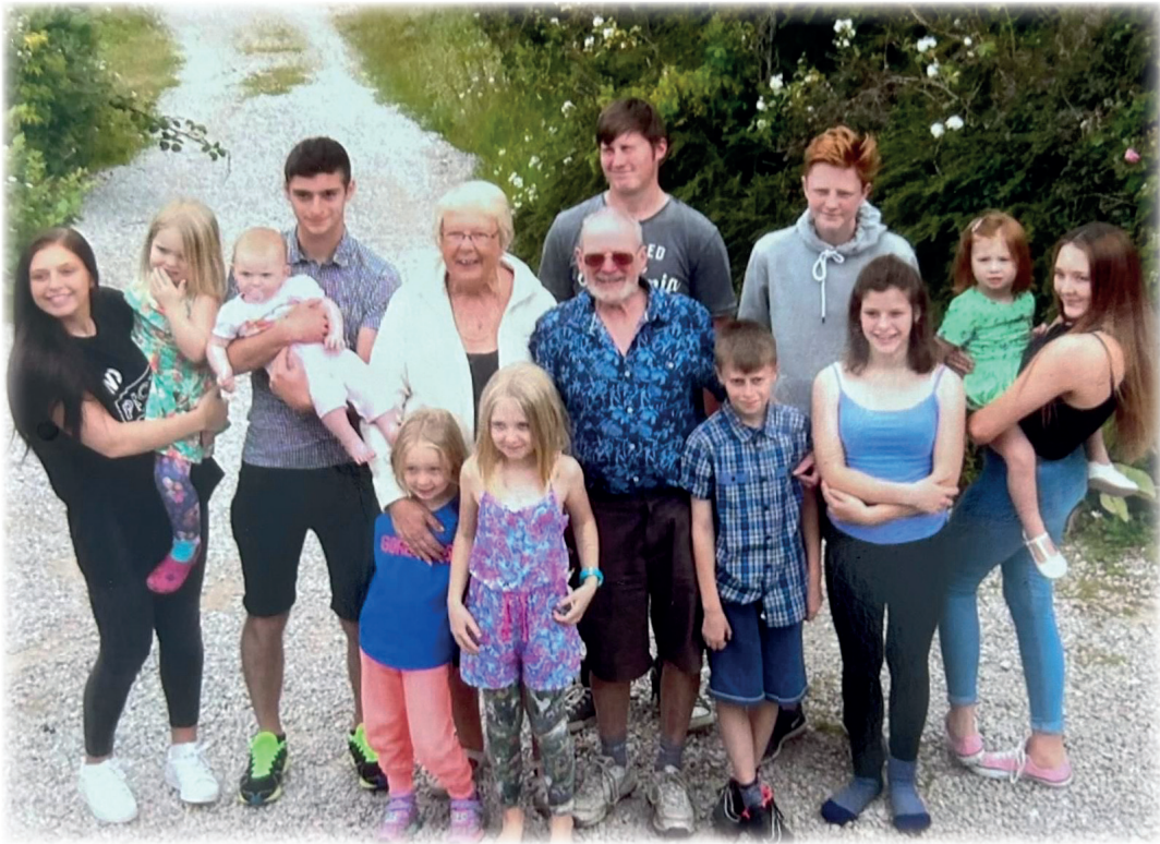
With all the Grandchildren - Golden Wedding July 2015