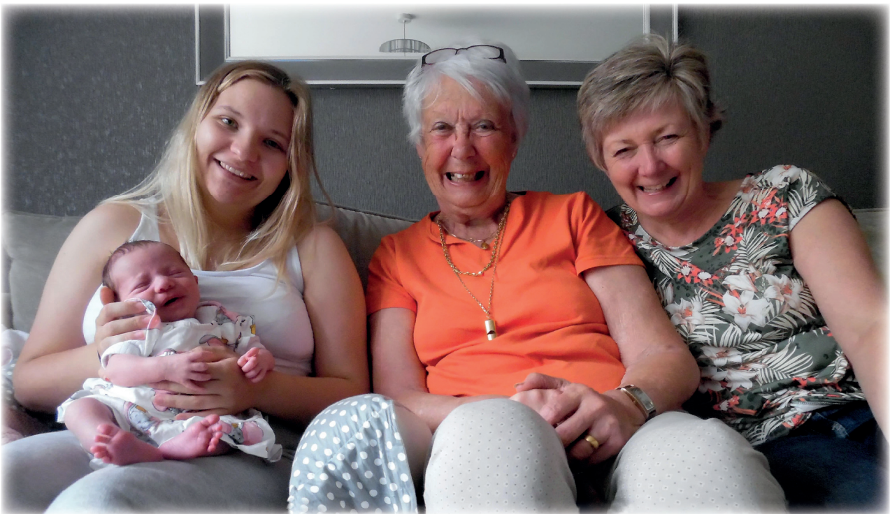
My little ray of Sunshine